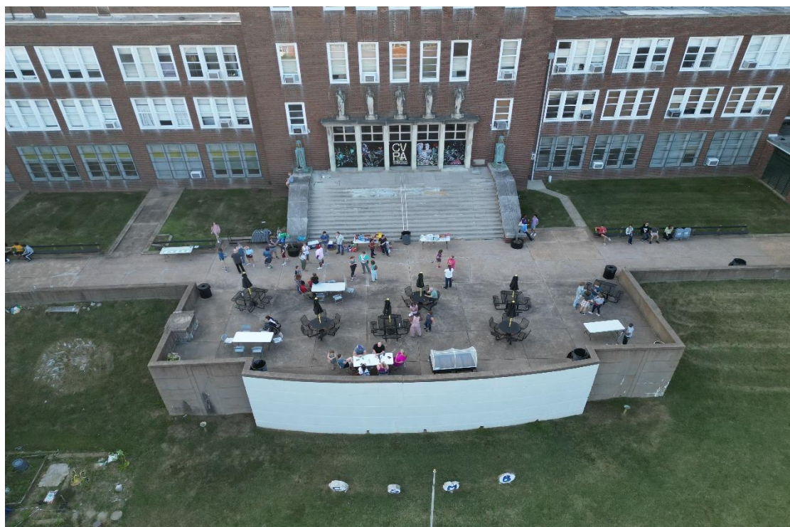
Drone footage provided by Titus Matheny of the Drone Crew Club offers a glimpse into the courtyard and the fun and games the PTO provided (Photo credit: TM '26)