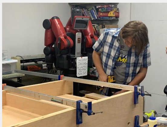
A robotics team member prepares for a fulfilling season.

There are many fresh players on the boys' soccer team this year that have helped them strive for new heights throughout the season. Many new players from McKinley have put in a lot of work to help the team and the appreciation for those players is evident. Each game is important to each player and the team is incredibly supportive of one another in the fact that they genuinely want the best for each other.