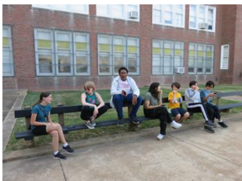
A group of new students enjoy hanging out in the courtyard.

The PTO Family Gathering a few weeks ago was an amazing opportunity for the families of students to meet each other and have a fun time. There was plenty of pizza, and parents generously brought loads of snacks and sodas. There was so much extra, in fact, the leftover refreshments were saved for homecoming. A few members of the drone club even brought out a drone to fly around and show off. Younger siblings of students got to play yard games and have fun together. It's particularly important to build community in our school, and bringing everyone together is a terrific way to connect our diverse Collegiate family.