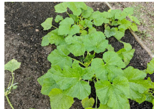
Shown above: Squash grown by the Secret Garden Club, available for sale at the end of October

The club will learn agricultural techniques such as, sustainable gardening, harvesting, and how to plan, grow and maintain seasonal flora and fauna. The first crop will yield squash by mid-October. The club is looking to sell the harvest to gather funds for Spring planting.