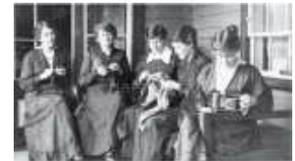
Bundling socks, 'War Chest' Sock Appeal, Sydney, May 1917