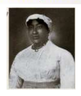
Reading Comprehension Activity Read about Annie Fisher Click Here