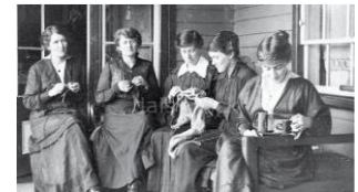
Bundling socks. 'War Chest' Sock Appeal, Sydney, May 1917