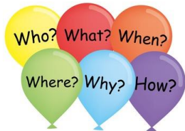
Who What When Where Why How Balloons